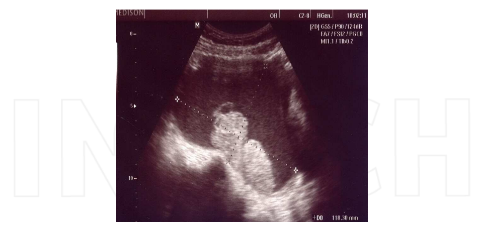
Picture 1. Transabdominal ultrasonography of 44 year-old, single woman with palpable pelvic mass has shown mixed solid cystic mass sized 11.8 cm. Postoperative pathologic diagnosed clear cell adenocarcinoma of ovary, FIGO stage IC.

ovarian cancer. A number of tumor markers were detected only in late staged of cancer as shown in table 3.