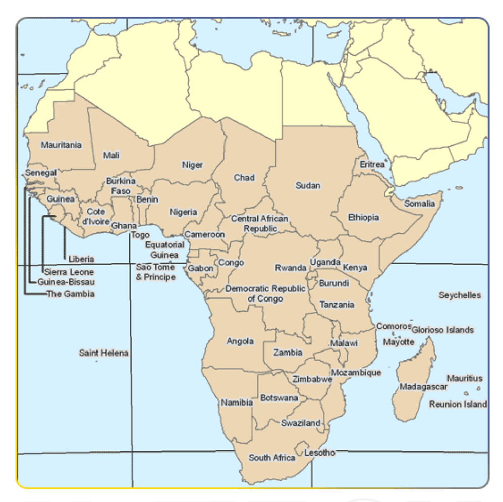
Fig. 1. Map showing the countries of Sub Sahara Africa (NB Southern Sudan became independent July 2011)

hospital and regional based cancer registry figures, reports from specific centres, conference proceedings and a review of work done on cervical cancer in the authors institution The University College Hospital Ibadan Nigeria.