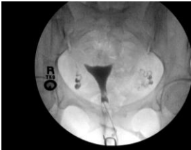
Hysterosalpingogram

Normal uterine shape, both tubes filled and spilled