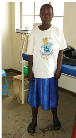
Figure 7 Young girl with constant urine leakage from a fistula

These women have sustained dreadful injuries through no fault of their own. As well as having a fistula and being constantly wet with urine (Figure 7), most will also have endured the trauma of having delivered a dead baby.