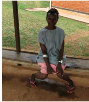
Figure 11 The indignity of living with a fistula

High-quality nursing care requires a good understanding of the suffering the women have endured from fistula and perineal tears. These women all need to be treated with dignity and respect when they arrive at a hospital for help. Many will have a strong offensive odour from being incontinent of urine or faeces, made worse by the urine being more concentrated as they reduce their fluid intake in an attempt to control the leaking (Figure 11).