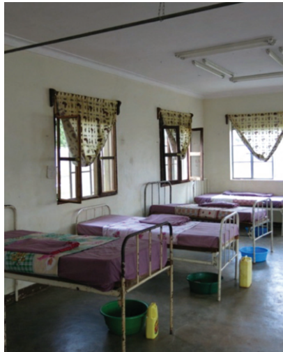
Figure 13 Example of a well-kept, clean surgical ward

Another source of hospital-acquired infection is from the ward beds and mattresses. Each time a patient is moved off a bed, the mattress should be washed with disinfectant and dried before making the bed for the next patient. The bedframe should also be washed down to prevent cross infection.