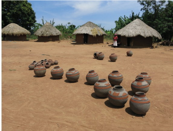
Figure 2 Rural settings where women deliver

However, the traditional birth attendants do not always recognise early enough when labour is obstructed and when a caesarean section is the only option for safe delivery of a live baby. A series of events then unfolds with a delay in recognising obstruction, compounded by further delays in getting to hospital and then in getting to theatre for a caesarean section. By this time, the baby is usually dead and, if the mother survives, she is likely to have developed a fistula from the pressure of the baby's head in the pelvis during obstructed labour.