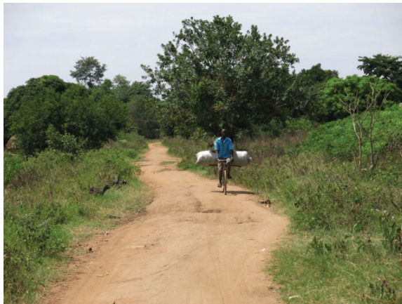
Figure 3 Transport can be difficult due to poor road networks