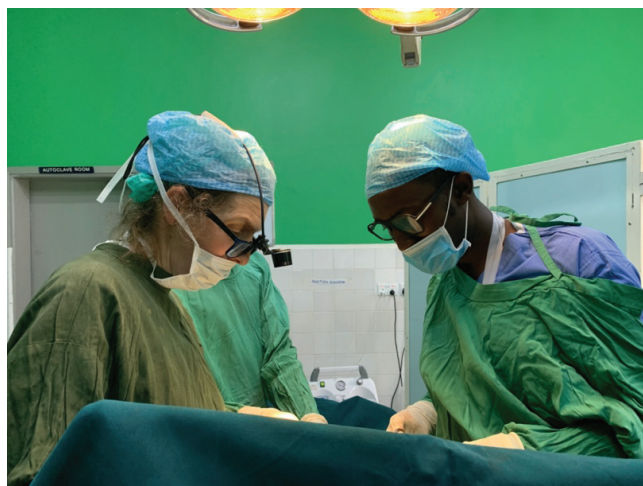
Figure 1 Highly skilled surgeons at work

However, the International Federation of Gynecology and Obstetrics (FIGO) is currently addressing the training of fistula surgeons with their comprehensive Fistula Surgery Training Initiative. There are now many surgeons and holistic fistula care teams enrolled in the training programme from countries all round the world with a high obstetric fistula burden.