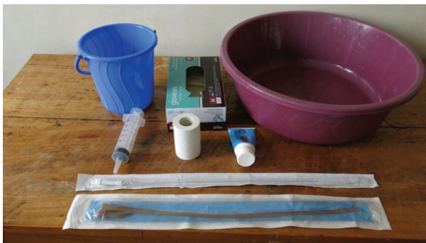
Figure 12 Basic items of equipment required