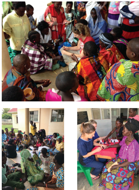
Figure 8 (top) Knitting lessons; Figure 9 (below left) Nail painting; Figure 10 (below right) Sewing lessons

The environment of a fistula treatment facility is a good way of introducing patients who have gone through similar experiences to discuss their problems with each other and develop a support network during their hospital stay. Many women attend for help in a very depressed state, but flourish as they are physically repaired, meet others in similar situations and are encouraged with the help of the nursing staff. Social activities during the day such as knitting, sewing lessons, painting nails or plaiting hair help to bring the women together and encourage them to talk (Figures 8-10).