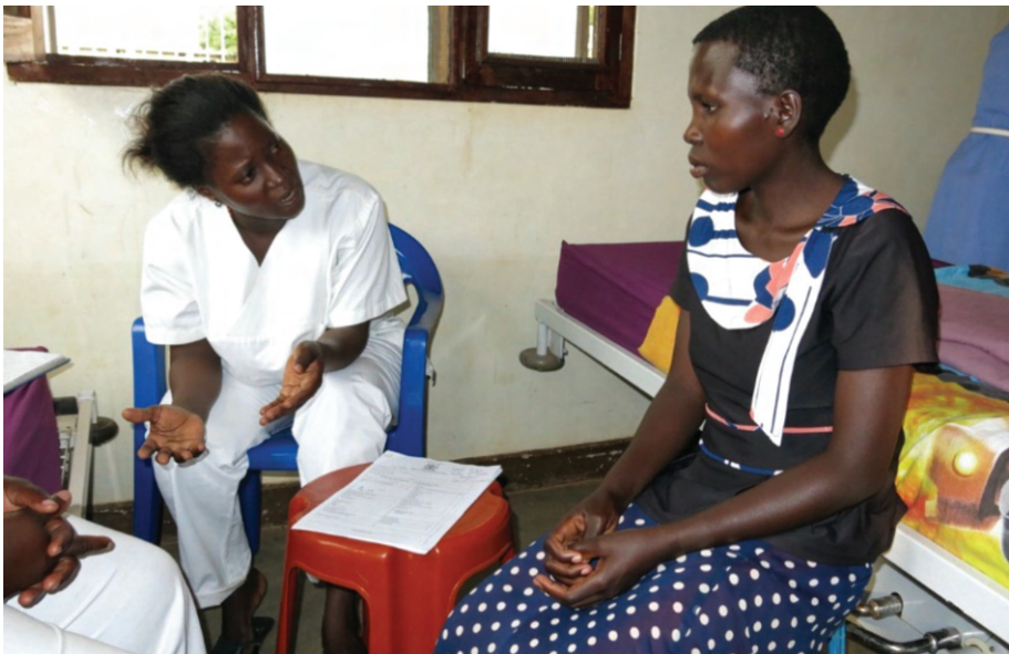
Figure 68 Counselling a woman with a failed repair

These women will need a lot of care and empathy to support them through the difficult period of coming to terms with going home continuing to experience the incontinence for which they initially attended.