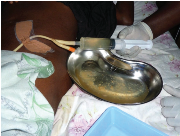
Figure 64 Carrying out a catheter flush

A catheter flush involves gently pushing 25 ml of saline through the urinary catheter to dislodge any clots or debris that may be blocking the catheter, then reattaching the catheter tubing and allowing it to drain freely. There can be a temptation to pull back on the syringe during irrigation, but this should be avoided, as it may inadvertently cause injury to the repair site in the bladder wall if the catheter balloon is sitting near the wound.