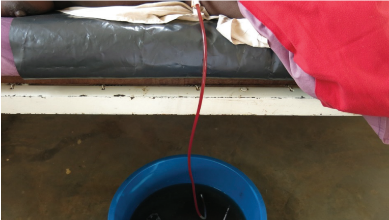
Figure 65 Bloody urine

undergone a ureteric re-implantation operation may have blood in their urine for a few days. This can be alarming for patients, but if they are drinking plenty, they can be reassured that it will settle in a few days.