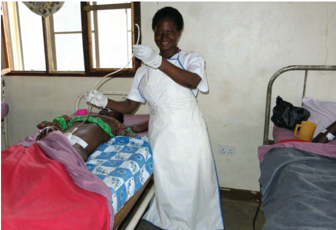
Figure 63 Checking if catheter is blocked

To check whether a catheter is draining (Figure 63), first raise the catheter above the level of the bladder and see whether urine runs back down the tube into the bladder. Take note of any kinks, blood clots, tissue debris or pus in the catheter that may be causing a blockage.