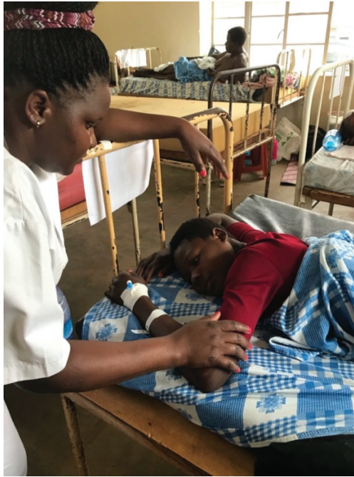
Figure 66 Patient being nursed prone

This involves keeping the patient in bed, lying and sleeping face down, getting out of bed only if they need to go to the toilet to empty their bowel.