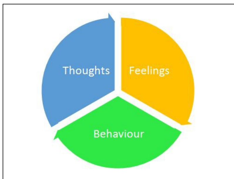
Figure 2 What is cognitive behavioral therapy (CBT)? CBT is a form of short-term psychological therapy based around cognitive and

There is some limited evidence to support the use of cognitive behavioral therapy (CBT) (Figure 2) in the management of opioid dependence during pregnancy. In a study of pregnant women on methadone treatment, CBT significantly reduced risky injecting behaviors but there was no change in sexual risk behaviors, drug use or injection frequency. 53